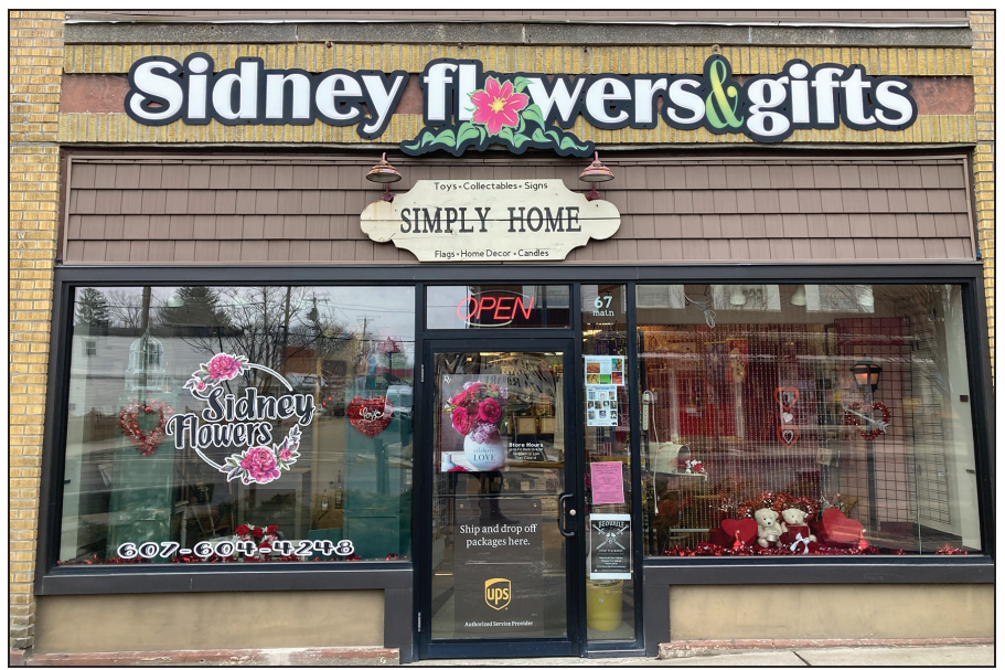
Alyshia KorbalThe Reporter

"They come wrinkled, looking like they aren't even gonna pull through, but they just need to hydrate," Wagner