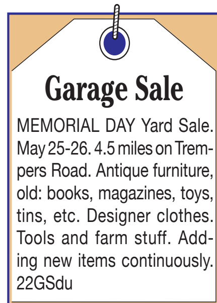
(Example of Tag Ad)

TAG YOUR AD: ONLY $300 MORE A Special Tagged Ad really stands out in the paper. Half-price the second consecutive week.